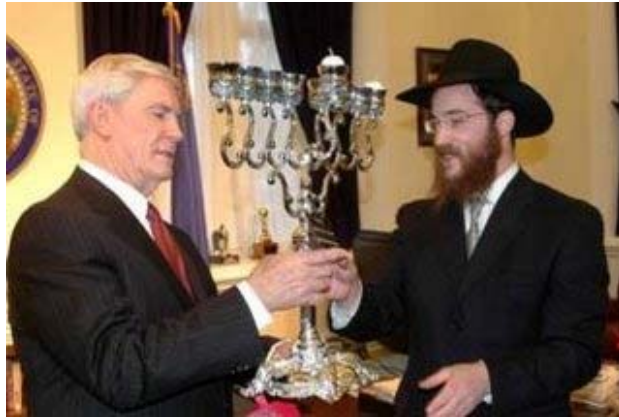
Governor of Nevada, Kenny Guinn